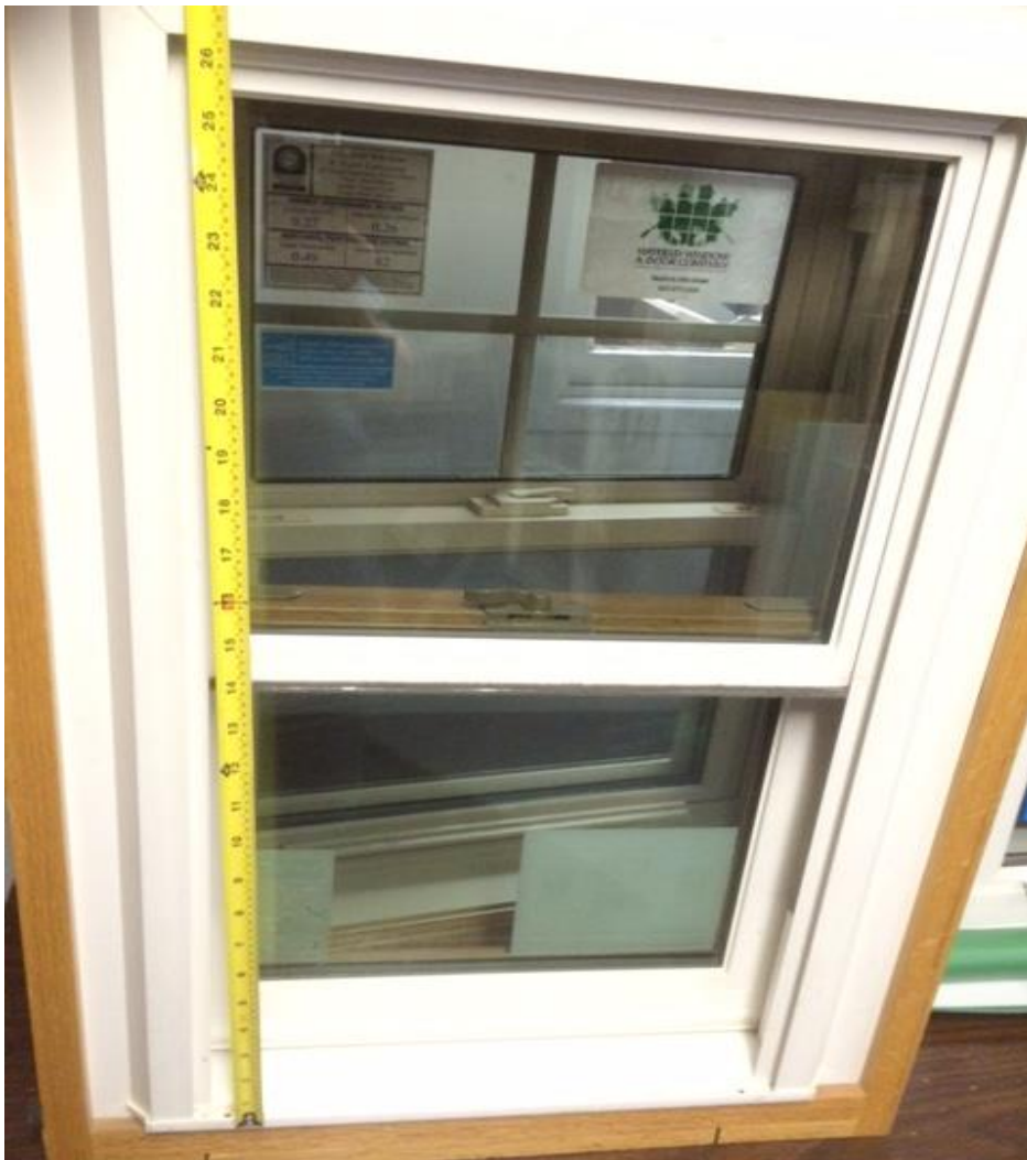
Figure C: Measuring the screen height