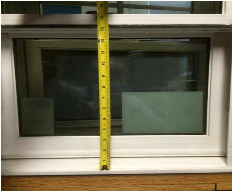
Figure D: Measuring screen height